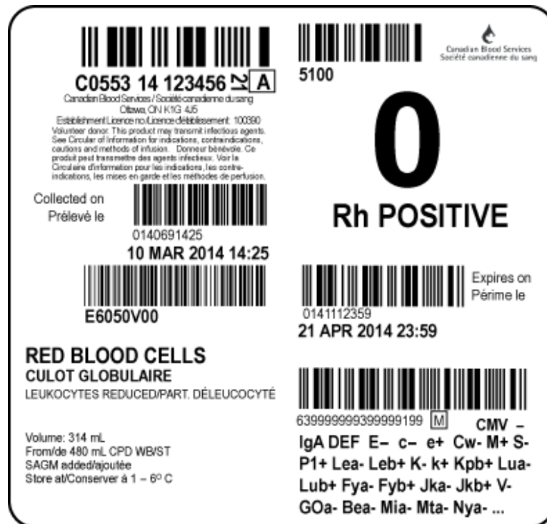
Figure 4: Canadian Blood Services ISBT 128 Label

Canadian Blood Services uses the standard 100 mm by 100 mm ISBT 128 Blood Component Label for all blood components. An example of a label for a Red Blood Cell component is shown in Figure 4.