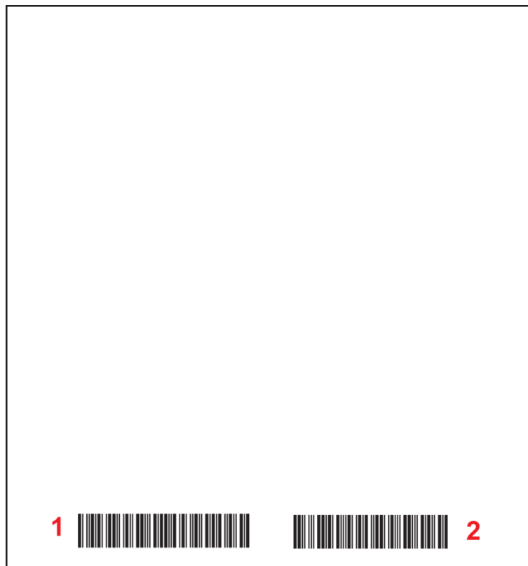
Figure 1: Bar Code Placement on Standard ISBT 128 Base Label

One or both of the container manufacturer's information bar codes may be covered by final labelling. It is preferable that the eye-readable text remain visible after the application of the final component label.